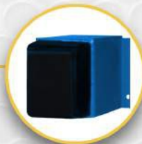
Bump Block & Molded Cord Rubber