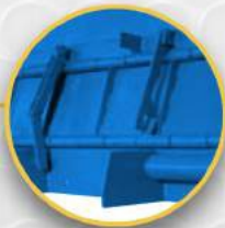
Formed Steel Gussets & Rib Reinforcement

Dynamic Capacities 20000; 250000; 30000 and 35000 lb. 66" 72" 78", and 84" Deck Widths 96" 102" 108" and 114" Overall Width